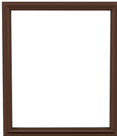
Painted Exterior Color - 7 Choices (See in Options Below)