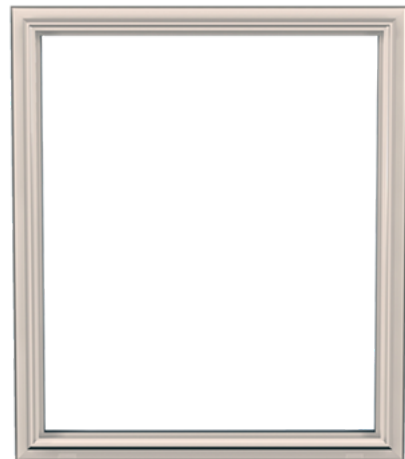
Interior Wood Grain Finishes (Cherry & Natural Oak)